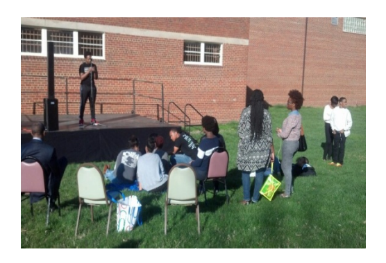
❖ Gaia Poetry Slam