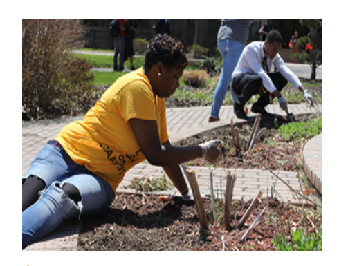
❖ Adopt a Flower Bed

BSU established an Earth Week Program with various green & sustainable events throughout the Earth Day week.